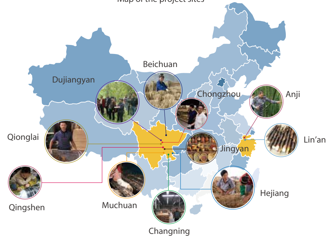
Map of the project sites

In the first two phases, the programme activities covered the four most earthquake-damaged areas, including: Beichuan Qiang Minority Autonomous County, Dujiangyan City, Anxian County and Chongzhou City. The third phase programme expands the work to the other six counties across Sichuan where that are rich in bamboo resources - Qionglai, Qingshen, Changning, Hejiang, Jingyan and Muchuan. The 4th phase expands the work to Zhejiang province.