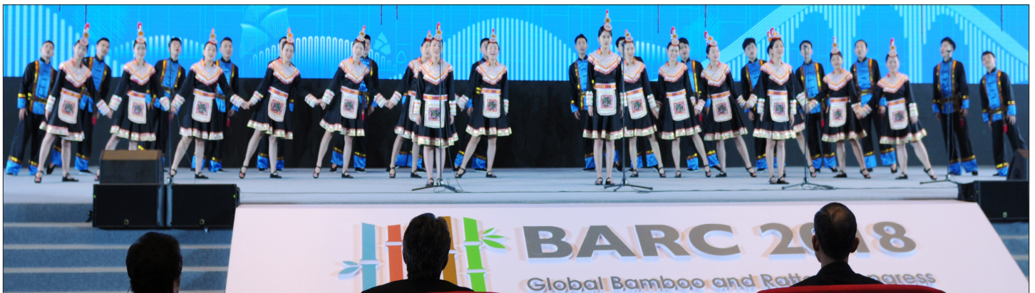
Melodious a capella chorus by Miao and She singers from the cultural heritage bamboo forest areas of Yong'an and Yibin, China.