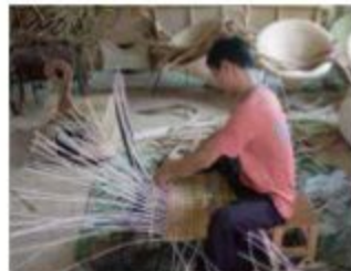
INBAR has signed an agreement with the Hong Qi rattan company in Hainan for training on rattan furniture-making.