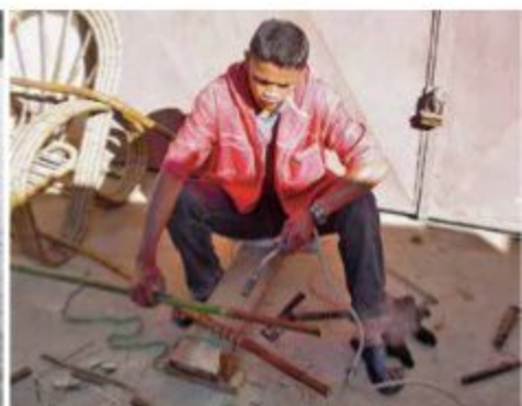
Making bamboo furniture in Madagascar