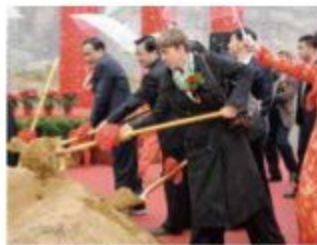
INBAR has signed an MoU with the government of Yiling, in China's eastern Jiangsu province, to establish a bamboo training centre. A ground-breaking ceremony was held for the centre in November.