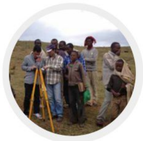
Preliminary preparations for the pilot demonstration site in Ethiopia

INBAR's work with the China Green Carbon Fund (CGCF) has resulted in an approved national standard in China for bamboo management for carbon credits. This means that China is the first country to formally accept bamboo as a tool for carbon off-setting. INBAR is working to adapt the standard so it can be adopted by other nations, initially Ethiopia, Kenya and Tanzania, in which INBAR, Zhejiang Agriculture and Forestry University (ZAFU) and CGCF will be running pilot demonstration projects on carbon off-setting with bamboo. This work will also enable INBAR, ZAFU and CGCF to test the "Payment for Ecosystem Services" potential of bamboo in carbon trading. INBAR hopes to extend this work to member countries in Asia and Latin America once successful cases have been developed in Africa.