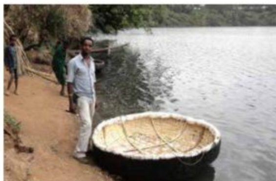
New-style bamboo boat produced in Ethiopia

The project also focuses on building south-south links between the national projects – trainers from Ethiopia have recently worked in the Madagascar and Mozambique sites, sharing knowledge and new technologies, and building partnerships for development. New partnerships are also being developed to ensure long terms sustainability – especially with existing and recently-established NGOs in each country that will act as community-based focal points for bamboo-based development in the future.