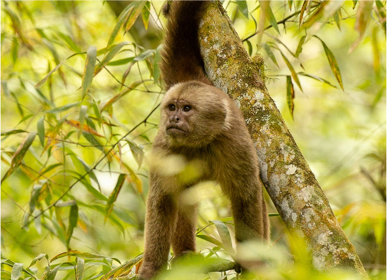
The Pacoche Coastal and Marine Wildlife Refuge is one of the last remaining homes for some endangered primates of Ecuador.