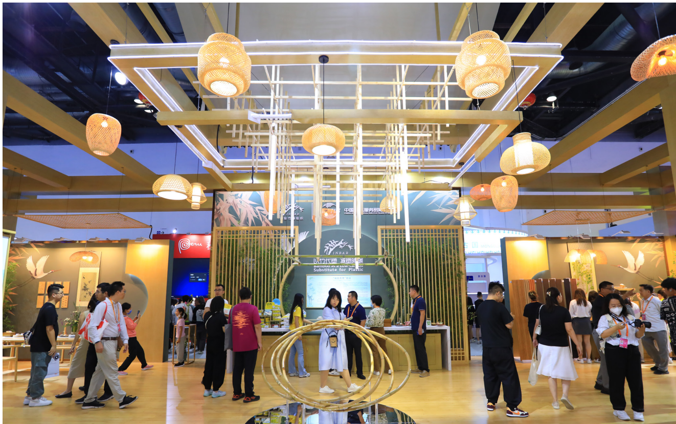
INBAR'S large exhibition space at 2023 CIFTIS in Beijing held at the China National Convention Center.

INBAR commissions research, conducts project work and raises awareness about bamboo and rattan across its 50 Member States.