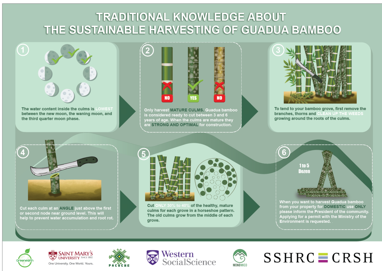
Infographic detailing traditional knowledge related to sustainable bamboo harvesting.