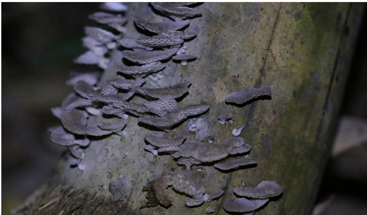
The fruit bodies of Favolaschia xtbgensis observed on a dead stem of Bambusa polymorpha in Xishuangbanna Tropical Botanical Garden. This photo is the mushroom captured under flashlight illumination.