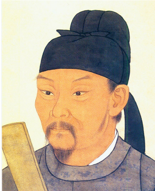
An artist's rendition of Du Fu.

Written by Du Fu (712–770) during the Tang dynasty, “Managing the House” is a somber reflection on the passage of time. Du Fu is one of China’s most renowned poets, whose works are studied daily in the classroom. Raised in a family of scholars, he spent much of his youth on the road, where he studied Confucianism and received praise for his poetry. He was well regarded by the imperial court, though not offered an official title. Later, during the An Lushan rebellion, he lost everything and entered into a period of severe destitution. He regained some land and status later in life, before legend states that he died while traveling on a boat, feasting and drinking for 10 days straight.