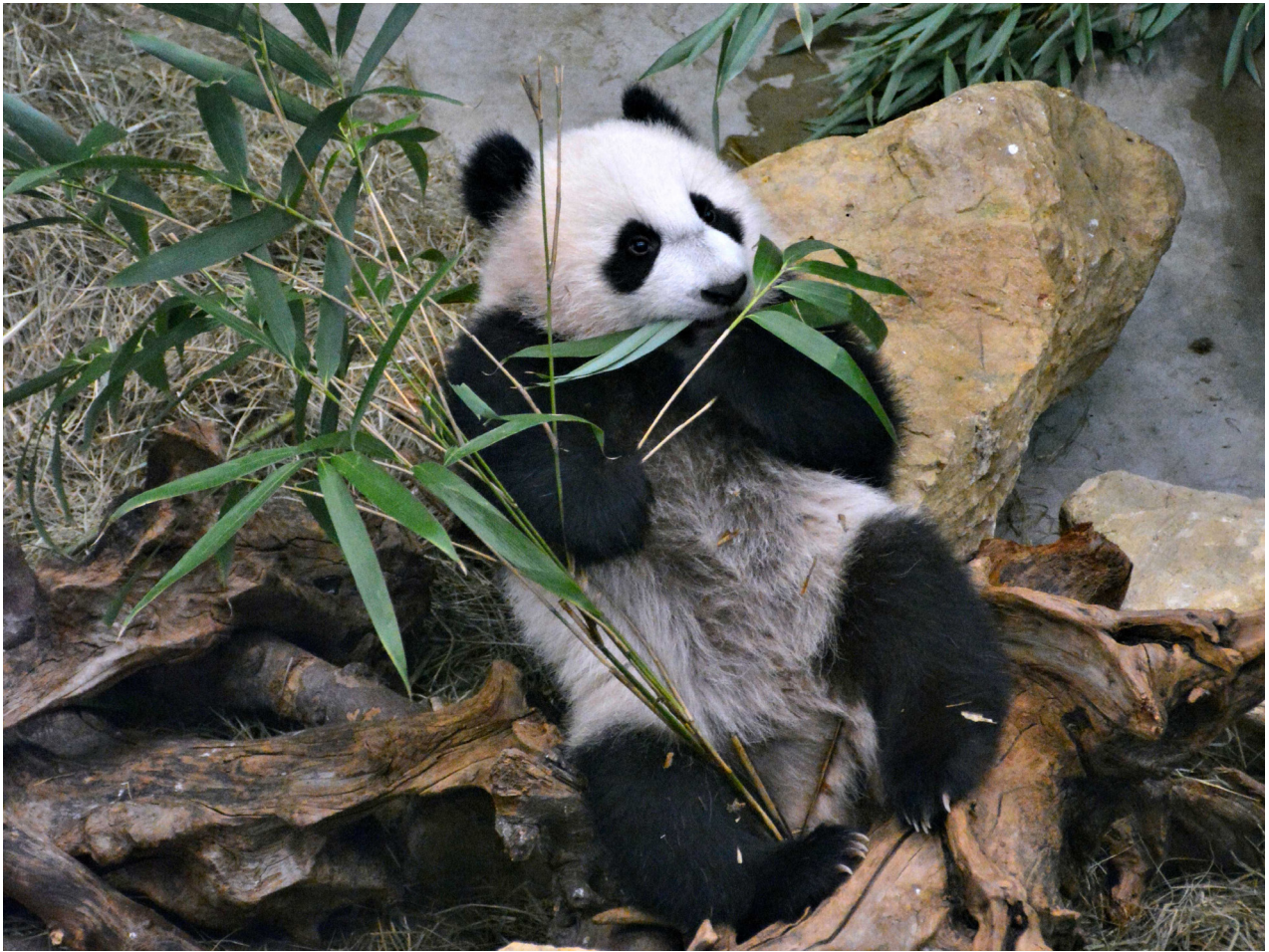
A panda happily munches on bamboo leaves.