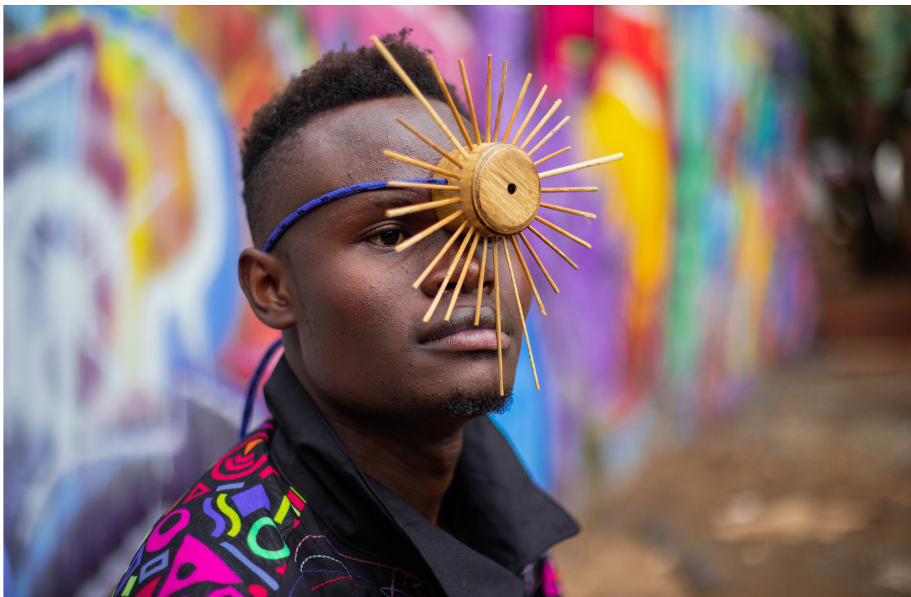
Nairobi Design Week 2023, where bamboo was showcased for creative designs.

Collating the latest international news and activities around bamboo and rattan sectors development.