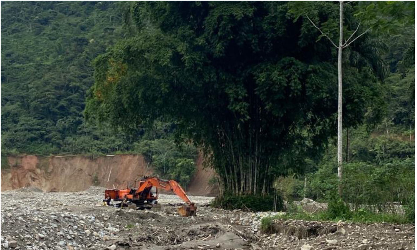
The bamboo species Dendrocalamus asper left standing on degraded land in Zamora Chinchipe province, Ecuador.

naturally form inside the plant. These unique microecosystems continue to surprise researchers, and further discoveries are anticipated.