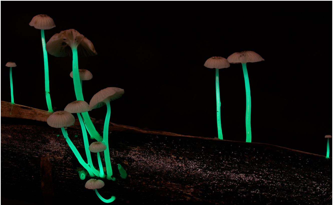
The enchanting Roridomyces phyllostachydis at night, found adorning bamboo stems near a stream in Meghalaya, Northeast India.