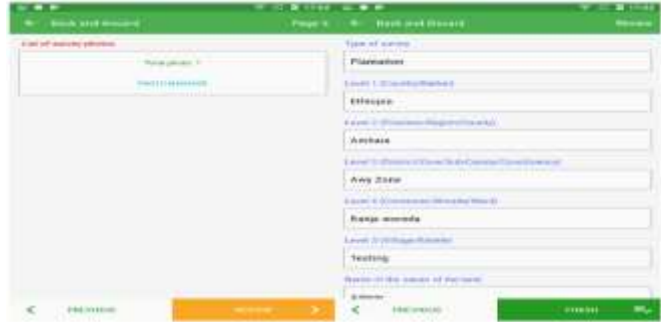
Figure 7 “Finishing” and “Closing” of a mapping data entry

The INBAR mobile app has a feature that allows the editing of survey entries. Once recorded, completed entries can be accessed by tapping the “Search” button. Points, lines, and polygons are displayed in blue, red, and green, respectively. The red cloud icon indicates that the entries are not synchronized with the online server. Tapping on an entry will reveal the map object on the viewer and open the “Edit” menu. Users can then rename, delete, or edit the survey form attached to each entry. Notably, the app does not offer an “Undo” function. Thus, users must exercise caution and deliberate thoroughly before making any modifications to an entry.