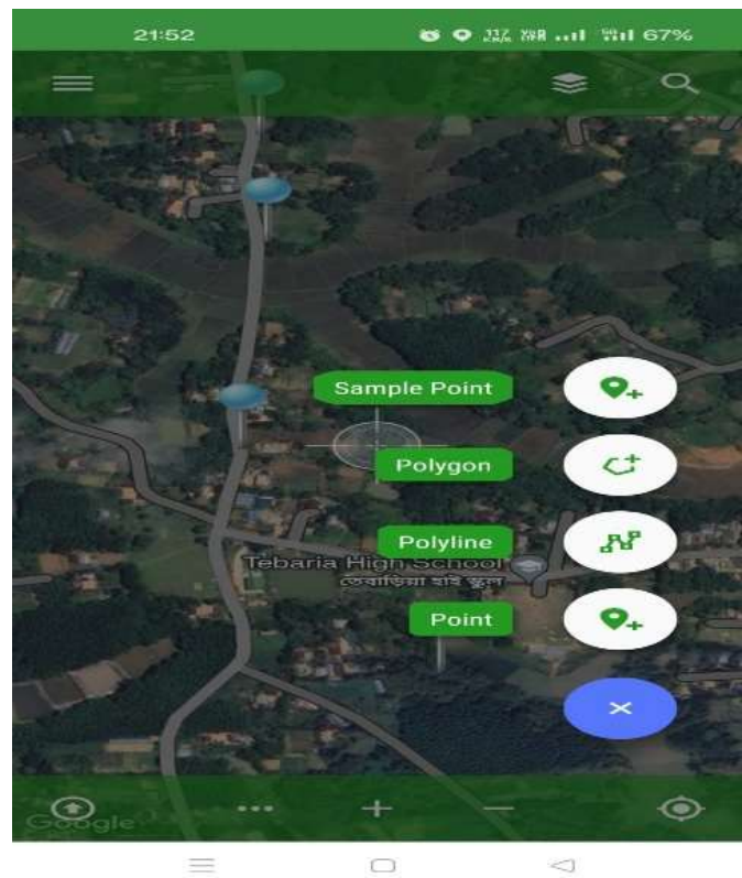
Figure 5 Overview of the process of creating a new map object

The CPSs are required to complete the survey form and navigate between pages to modify the input as needed. The boxes already contain predefined entries that can be expeditiously selected from a drop-down menu. The CPSs can then review the photos and form input before completing a survey entry (Figure 6).