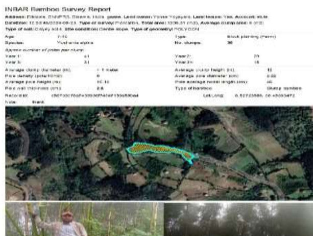
Figure 10 Survey data collected in Ethiopia using the INBAR mobile app