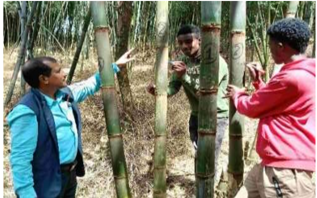
Figure 2 Demonstration of bamboo age marking to youth participants at an on-farm plantation.

Community engagement is a purposeful endeavor designed to develop a significant partnership between organizations and the communities they serve. An organized methodology guarantees inclusivity, active engagement, and enduring influence. The fundamental tenets of community engagement encompass the following: inclusivity, which means ensuring that all community members, particularly marginalized groups, are represented in decision-making processes; transparency, which is the upholding of clear and candid information regarding objectives, procedures, and results; collaboration, which is the process of engaging with community stakeholders, including local leaders, organizations, and smallholder bamboo farmers; sustainability, which involves formulating initiatives that yield enduring positive effects on the community; and respect the cultural sensitivity, which entails acknowledging and appreciating the cultural, social, and economic contexts of the community. Notably, community participation is essential in any development