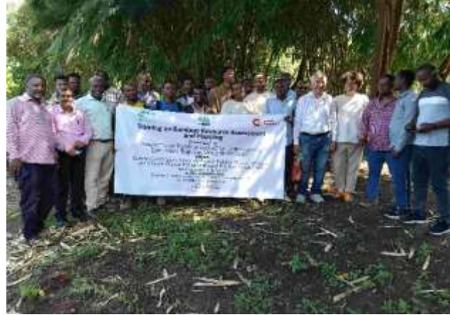
Figure 3 Capacity building training for the on-farm mapping of bamboo community stewards

At the start of the mapping, the INBAR-AECID Bamboo Supply Chain Development Project team conducted hands-on INBAR Bamboo Survey App training for 50 local youth, CPSs, and the frontline managers of the Ethiopian Forestry Department in South Ethiopia Regional State and Sidama Ethiopia Regional State (Figure 3). The training equipped the participants with key skills in the features and functionalities of the mobile application, installation and setup, and user interface and navigation, as well as homestead bamboo farm data collection, validation of the collected survey data, and synchronization to the INBAR Bamboo Monitoring System ( https://bambooafrica.inbar.int/ ).