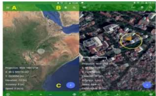
Figure 4 INBAR mobile app for mapping bamboo farms

The mobile client or mobile app is compatible with Android version 5.0.0 and above and requires a device with a built-in camera and a global positioning system sensor. The app supports map files in MBTiles format. The stewards are responsible for installing the mobile app on their phones by opening the designed package file (*.APK), which includes installation instructions. The web client requires an internet browser capable of supporting HTML and JavaScript. Upon the initial launch of the INBAR mobile app, the mobile client prompts the user to grant the app permission to access the device's storage and location. Once initiated, the mobile client displays three primary regions within its user interface: Sidebar A, Topbar B, and Bottom Controller Bar C (Figure 4).