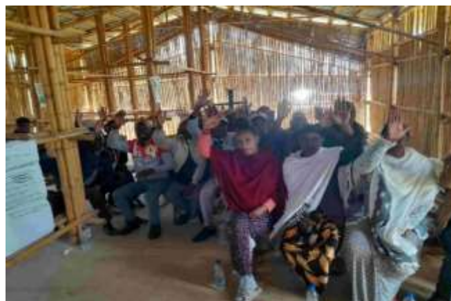
Figure 11 Participatory SWOT analysis exercise for members of the cooperative

The Hula Bamboo Cooperative consists of 11 primary bamboo cooperatives with 780 (620M/160F) members from the Hula District, Sidama Regional State, Ethiopia. The cooperative was established in 2022, with the aims of facilitating bamboo marketing through value addition, obtaining necessary support from governmental and nongovernmental organizations involved in bamboo development, and boosting economic returns. The INBAR has been supporting the cooperative by providing technical training on sustainable bamboo harvesting and management, bamboo charcoal production, and production of bamboo mats. The INBAR project also supports the construction of bamboo depots and preservation and treatment facilities, as well as the provision of bamboo primary processing equipment and tools. The multifaceted bamboo-based livelihood development plan can be effectively monitored using remote sensing and GIS techniques due to its inherent advantages and scientific knowledge-based analysis (Goswami et al., 2010). Training on bamboo mapping and monitoring was also delivered to forestry experts in the Arbegona and Malaga districts.