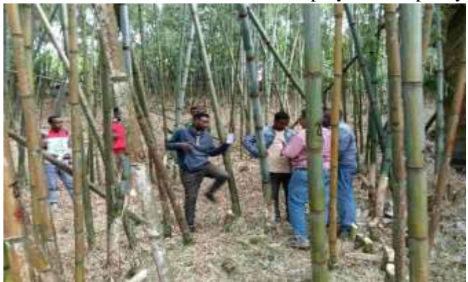
Figure 9 Hands-on field training of CPSs for the mapping of on-farm bamboo plantations

CPSs are engaged to undertake on-farm bamboo resource assessment. Prior to field deployment, capacity building/training was conducted to familiarize them with the task (Figure 9). The focus of the capacity building included key components of the INBAR mobile app, its features and functionalities, installation and setup, user interface, navigation, farm measurement, and hands-on demonstration. Homestead bamboo farms in the Sidama Ethiopia Regional State and the South Ethiopia Regional State of Ethiopia, as illustrated in Table 1, were assessed. In particular, the on-farm bamboo resource inventory was conducted in nine districts/woredas (three in Sidama Ethiopia Regional State and five in South Ethiopia Regional State) by the CPSs. The study encompasses 917 smallholder farmers and 201.595 ha of bamboo-