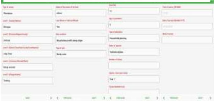
Figure 6 Mobile app data template/boxes